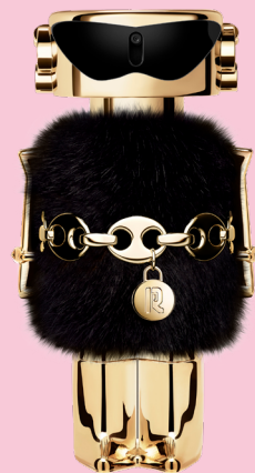
Rabanne FAME COUTURE EDP 50ML £144