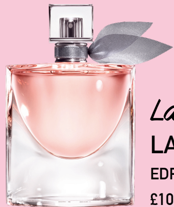
Lancôme LA VIE EST BELLE EDP 100ML £105.99