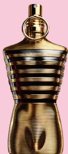
JPG LE MALE ELIXIR EDP 75ML £81