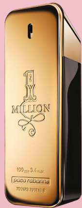
Rabanne 1 MILLION EDT 100ML £78.99