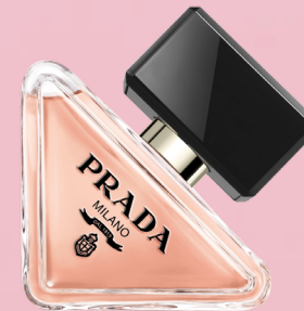
Prada PARADOXE EDP 30ML £61.99