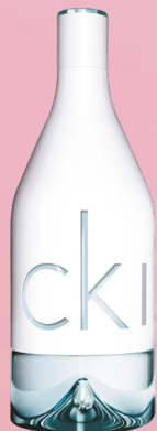
Calvin Klein CKIN2U EDT 100ML £23.99