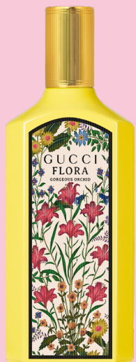
Gucci FLORA ORCHID EDP 50ML £89