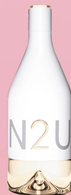
Calvin Klein CKIN2U FOR HER EDT 100ML £23.99