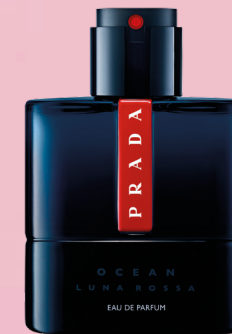
Prada LUNA ROSSA OCEAN EDP 50ML £65.99