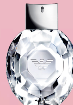
Emporio Armani DIAMONDS EDP 100ML £51.99