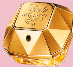
Rabanne LADY MILLION EDP 80ML £95.99