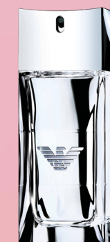
Emporio Armani DIAMONDS FOR MEN EDT 75ML £43.99